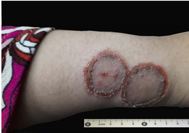
Fig 1 - Two well circumscribed skin lesions on the forearm with raised edges