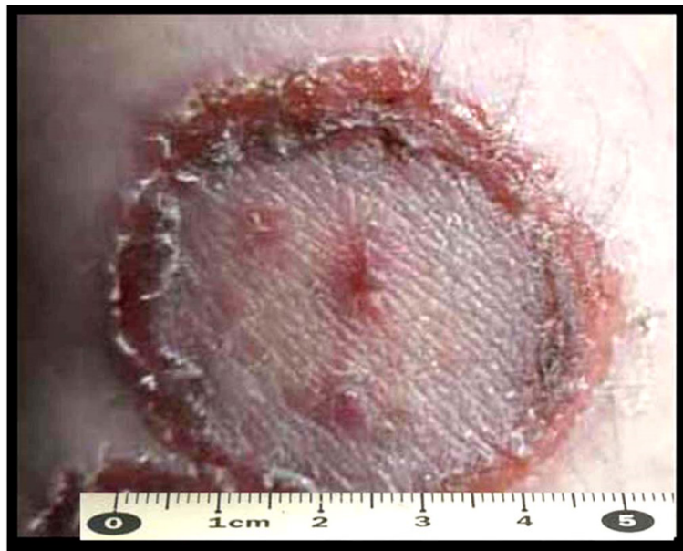
Fig 2 - Close up view showing raised erythematous margin and small vesicles